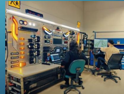
ELECTRICAL AND ELECTRONIC LABORATORY