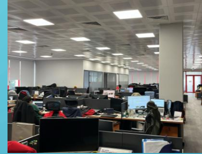
R&D OFFICE 2